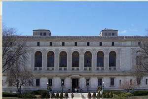
DETROIT PUBLIC LIBRARY MAIN BRANCH