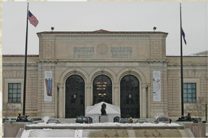
DETROIT INSTITUTE OF THE ARTS