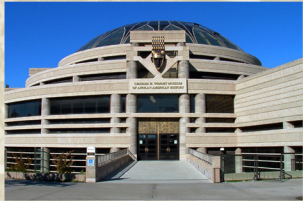
CHARLES H WRIGHT MUSEUM OF AFRICAN-AMERICAN HISTORY